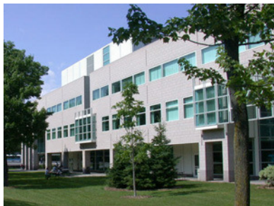
Pavillon Desjardins (where the event will take place)